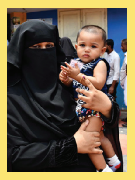
Don't forget to inform your friends & families to cast their vote through WhatsApp and other social media platforms like Instagram & Facebook.